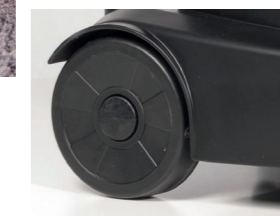
Large wheels with spoke design.