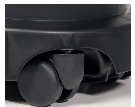
Robust running castors with bumpers.