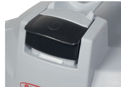
Large foot switch for turning on and off without bending down.