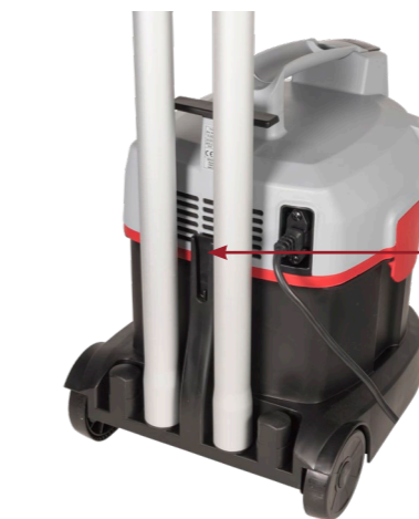
Four accessory slots on the back. Parking position for optional turbo brush or parquet nozzle