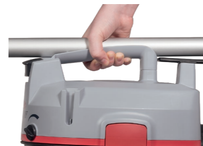
Maximum ergonomics: with a weight of only 4,2 kg, the Floory can comfortably be carried with one hand.