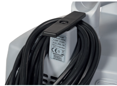
Closable, voluminous cable hook.

As with all other SPRINTUS products, the design and development are of high quality and practical in every detail. With our FLOORY, the user receives a perfect all-round package, a reliable and economic partner for hard floors and carpet. Aluminium tube, elastic bumpers and easy emptying. The 10m power cable and the 2,0m step resistant suction hose without memory effect ensures maximum maneuverability.