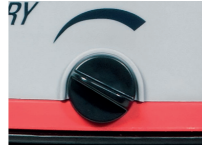
Power regulation adjustable to all types of surfaces.